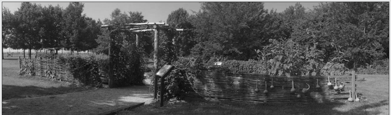
The Plum Bayou Garden at Toltec Mounds Archeological State Park.

Ceremonial Centers, like Toltec, brought people from area villages for community celebrations. The celebrations tie people from many villages into a single community. Archeologists think the Woodland Indians were less egalitarian. The people buried in the mounds were highly respected members of the community. People gained respect and became leaders by their skill in hunting or success in trading. Leaders organized important social and ceremonial events and made sure people got along.