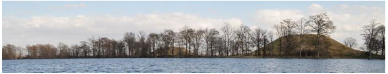
Toltec Mounds from Plum Bayou.

Even though Toltec is a large site with many mounds, archeologists have found that few people lived there. Rather than living at Toltec, Woodland Indians visited this ceremonial center for big yearly or seasonal events for everyone living in the area. It was the gathering place for people from nearby villages to come together for celebrations. People held large feasts at Toltec. Archeologists know this because they have found areas of the site with a large amount of animal bones and decorated pottery. Archeologists think that many people brought food in their finest decorated pottery and prepared deer and other animals for a large meal. The large number of animal bones suggest that people came from all around to be a part of the feasts.