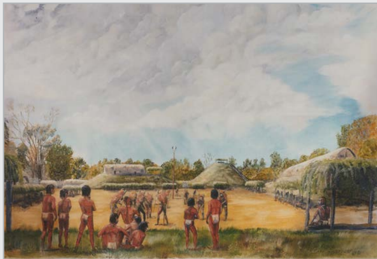
Quapaw Village.

When Europeans arrived in the Louisiana Territory (which includes present-day Arkansas) during the 17th and 18th centuries, they encountered hundreds of Indian communities living in what is now Arkansas. These brief summaries provide a peek into the lives of Arkansas Indians between 1541 and the present.