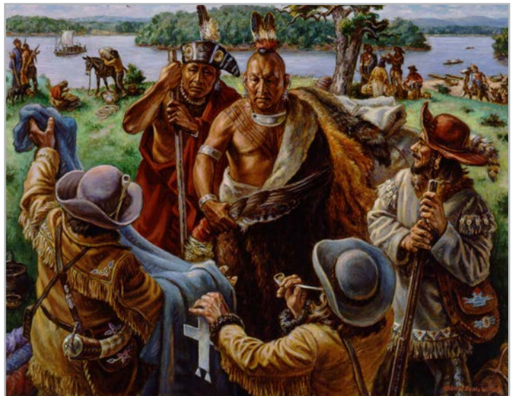
Osage traders.

Osage. Osage Indians lived in southwest Missouri but hunted buffalo and other animals in Kansas, Oklahoma, and Arkansas. They raised corn, beans, squashes, pumpkins, and other crops in nearby fields. They built longhouses much like the Quapaws. Osages traded food, hides, and other animal products to European and American settlers. This trade brought wealth and power but Osages were forced to sell their lands in the 19th century. They moved first to a reservation in Kansas, and later to Oklahoma. Today, more than 10,000 Osages live near Pawhuska, where they have the oldest Native American museum in the country.