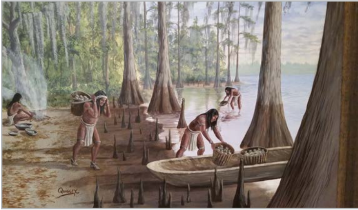
Tunica Saltmakers.

Tunica. Tunica Indians lived along the Mississippi River in southern Arkansas and northern Mississippi. Their villages had circular houses with mud-plastered walls and grass-thatched roofs. They raised corn, beans, squashes, and other crops, and gathered wild plant foods and hunted and fished. They made salt from salt-water springs, trading it with other Indians and Europeans for food and other goods. In the 19th century, Tunicas joined Biloxi Indians living near Marksville, Louisiana, where they continue to live today.