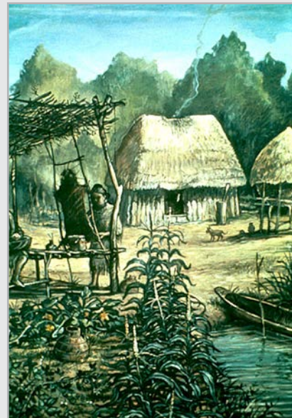
A Caddo farmstead.

Caddo. Caddo villages were scattered across southwest Arkansas and parts of Texas, Louisiana, and Oklahoma. Families had their own farms with one or two circular, grass-covered houses, work areas, and crop fields. Families grew corn, beans, pumpkins and squashes, and fruits, and hunted and fished in nearby forests, fields, and streams. They also produced salt for their own use and for trade. When the United States forced Caddos from their lands after 1840, they moved first to central Texas and later to Oklahoma. More than 5,000 Caddos live near Binger and Oklahoma City today.