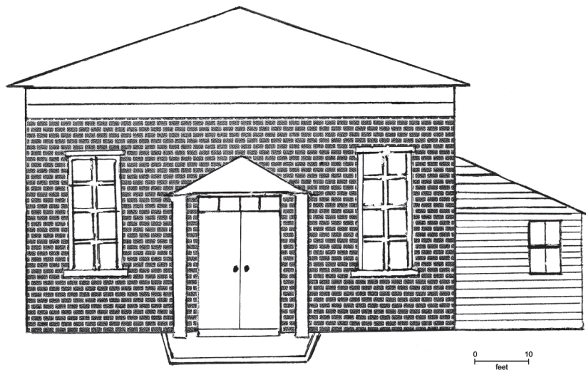
Reconstruction of the Second Mount Comfort Church, ca. 1848, based on archeological evidence.

Jerry E. Hilliard (Arkansas Archeological Survey)