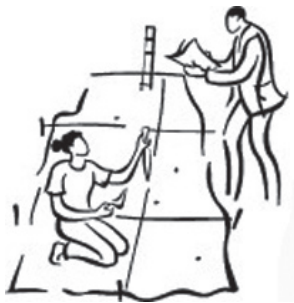
Archeologists deal with material evidence of past human activity.

Archeologists work much like detectives to determine from fragmentary evidence what actions or events produced the remains preserved at a site. They then use this information to compare and contrast what people did at different time periods and from one region to another. This ability to study activity patterns over long periods of time is one of archeology's great strengths. A weakness of the archeological record is that it is incomplete. Most items crafted from perishable materials, such as wood, plant fibers, and most animal products,