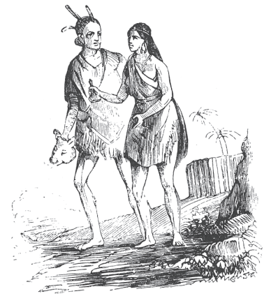
Ethnographers directly observe cultural activities.

Ethnographic accounts also have limitations. First, most ethnographers choose to examine a particular aspect of culture—for example, social organization, religion, economic activities, or political relations—so no single ethnography provides a