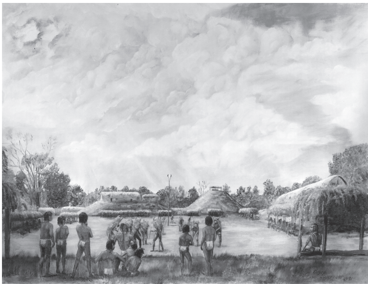
A view of what the Quapaw village Osotouy may have been like. From a painting by Quapaw artist Kugee Supernaw.

The Quapaws were close allies of the French in colonial Louisiana. During the subsequent Spanish regime, the Quapaws helped defend the colony from invasion by Indians allied with the English. The Quapaws tried to maintain their policy of peaceful coexistence when the United States purchased the Louisiana Territory in 1803, but they were forced to surrender their Arkansas lands to the U.S. government in 1818 and 1824. A Quapaw reservation was established in 1839 in northeastern Oklahoma. Today there are about 2000 Quapaws, most of whom live near Miami, Oklahoma.