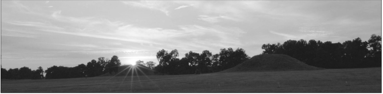
Toltec Mounds.