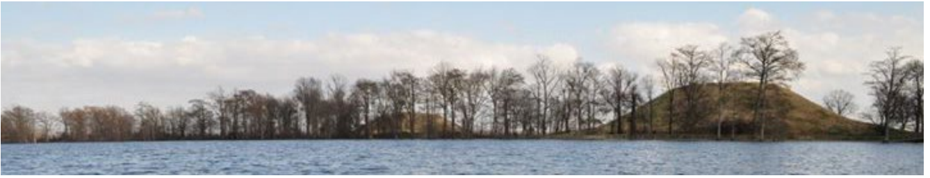
Toltec Mounds from Plum Bayou.

Even though Toltec is a large site with many mounds, archeologists have found that few people lived there. Rather than living at Toltec, Woodland Indians visited this ceremonial center for big yearly or seasonal events for everyone living in the area. It was the gathering place for people from nearby villages to come together for celebrations. People held large feasts at Toltec. Archeologists know this because they have found areas of the site with a large amount of animal bones and decorated pottery. Archeologists think that many people brought food in their finest decorated pottery and prepared deer and other animals for a large meal. The large number of animal bones suggest that people came from all around to be a part of the feasts.