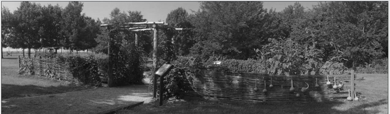
The Plum Bayou Garden at Toltec Mounds Archeological State Park.

Ceremonial Centers, like Toltec, brought people from area villages for community celebrations. The celebrations tie people from many villages into a single community. Archeologists think the Woodland Indians were less egalitarian. The people buried in the mounds were highly respected members of the community. People gained respect and became leaders by their skill in hunting or success in trading. Leaders organized important social and ceremonial events and made sure people got along.