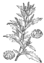
A goosefoot plant.

Woodland Indians cleared areas of land to grow these domesticated plants. Today, people don't eat most of the crops that Woodland Indians grew. You probably haven't eaten little barley, sumpweed, goosefoot, or maygrass. One plant that you likely have eaten that Woodland Indians farmed is squash. You may also have eaten quinoa, a plant much like goosefoot. Although archeologists know many of the plants Toltec people grew, archeologists have identified a seed from a plant that remains a mystery. The seed is from a domesticated grass and to this day archeologists have not been able to find which grass this seed comes from. Woodland Indians cooked seeds from these plants into stews and porridges.