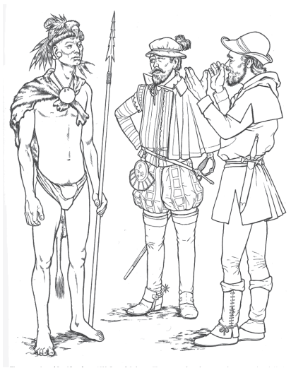
A Timucua (Florida) warrior meets Spanish explorers in 1528. All wear traditional clothes for their cultures.

Another animal product that Indians made great use of was bird feathers. We are all familiar with the image of the Plains Indians' long feather headdresses, but feathers were used in other ways too. The Southeastern Indians designed beautiful feather cloaks,