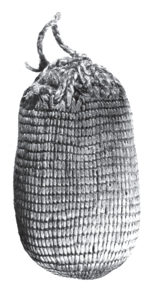
Woven bag from an Ozark bluff shelter. It contained seeds

Artifacts made of various fabrics have also been found in the dry bluff shelters of the Ozark Moun-