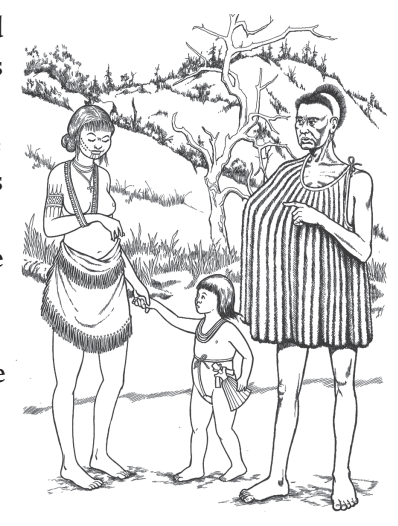
This North Carolina family from the 1850s is mostly dressed in traditional style. The mother wears a fringed deerskin skirt and the father a cape of animal skins. The daughter wears very little.

The basic item of clothing for women was a short deerskin skirt that went from the waist to the knees. In cold