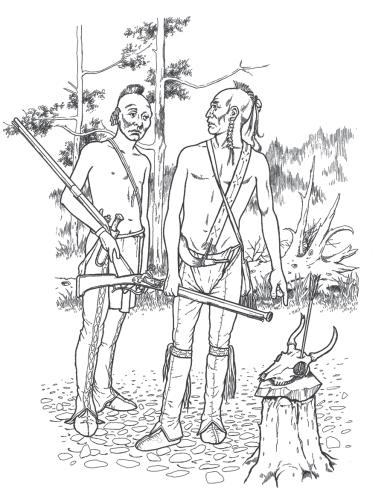
Osage hunters wearing deerskin leggings. The Osages inhabited parts of Arkansas during the historic period.

Decorative sashes, probably fingerwoven in a variety of geometric designs and with long tasseled ends, served as belts and chest decorations. A small pouch was often attached to the belt. Deerskin leggings, which looked like trousers, were sometimes worn; they were suspended from the belt and gathered below the knees with garters. In cold