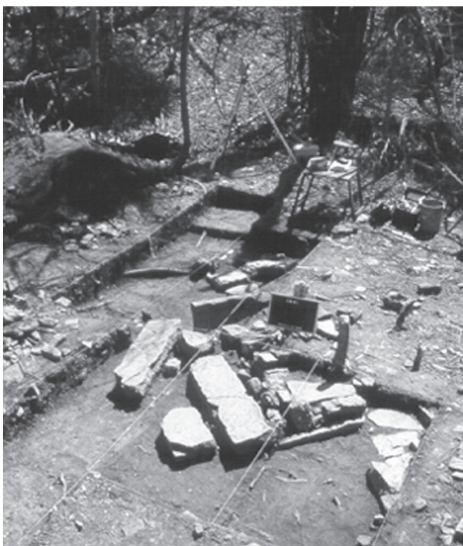
Feature 9 (house) foundation at the Van Winkle site, showing fireplace remains.

We already knew the mill was in operation for a long time, both before and after the Civil War. So our next question became: "When was the house occupied?" The manufacture dates of the artifacts we found mainly fell between 1870 and 1900. (We could tell this based on information from documents like factory records and manufacturer's advertising.) This date range was confirmed by the manufacture dates of building hardware, including nails and window glass.