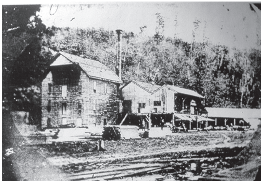
Van Winkle's Mill ca. 1880.