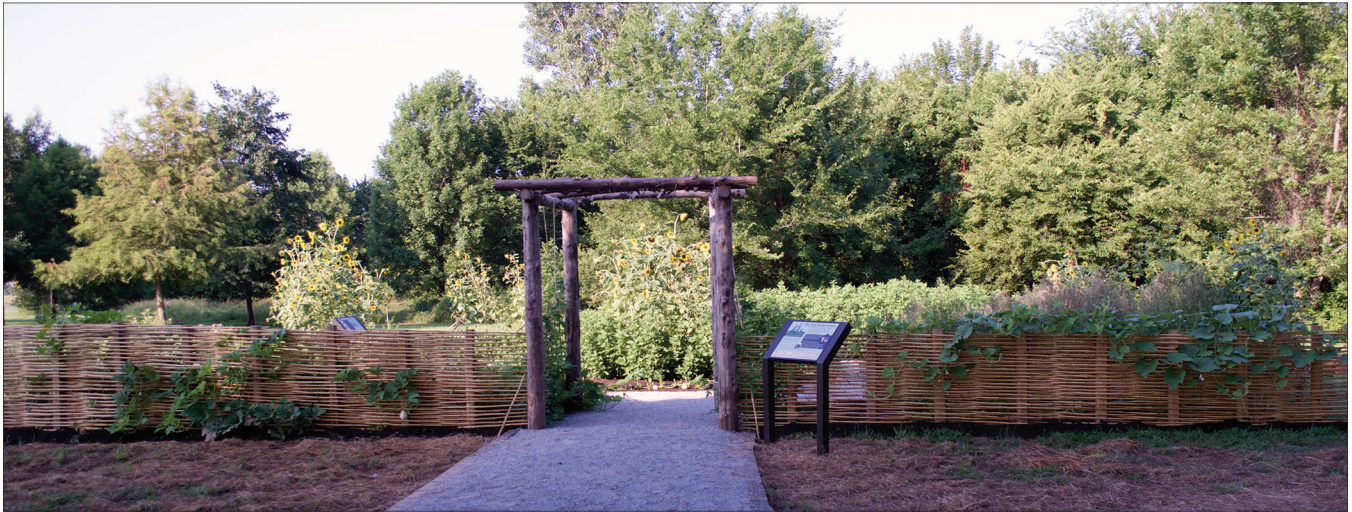
Entrance to the Plum Bayou Garden at Plum Bayou Mounds Archeological State Park.